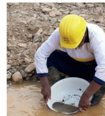
Eco gold and crystal mining, Fifi Bijoux