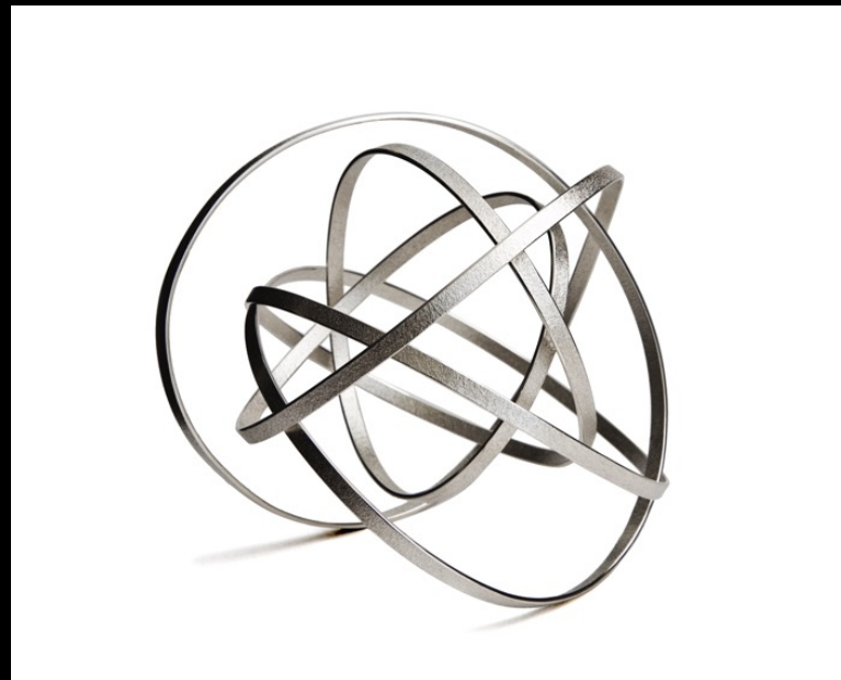
Orbit #5 arm sculpture, initialled & hallmarked 10 x 12 x 10 cm small/medium - arm size, adjustable individually sculpted, unique within a series