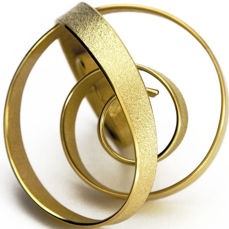
Rose , 2021 sculptural statement ring, initialled & hallmarked 18 kt Fairtrade Gold 4.3 x 4.1 x 4.2 cm individually sculpted, unique within a series of 12