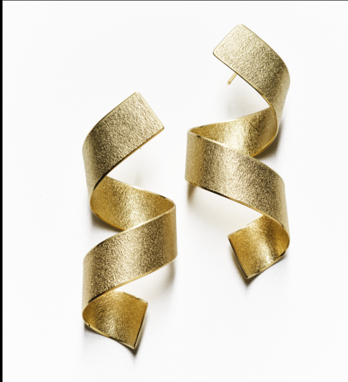
Man Ray Spirals, 2022 sculptural earrings, initialled & hallmarked 18 kt Fairtrade Gold 5.5 x 2.4 x 1.7 cm one earring - 7.9 grs Individually sculpted, unique within the series of 12