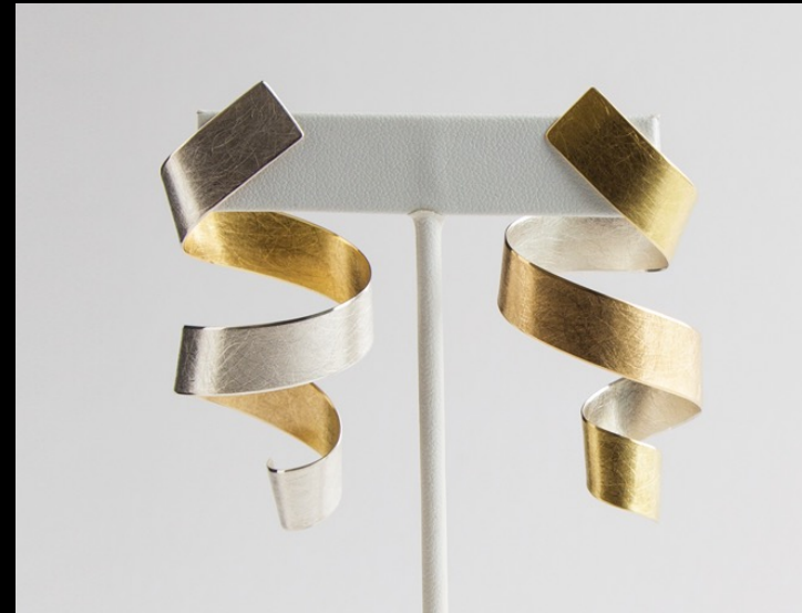
Man Ray Spirals, 2022 sculptural earrings, initialled & hallmarked bimetal - 18 kt gold fused with sterling silver, 36% gold content, all recycled 6.3 x 3 x 2 cm one earring - 9.5gr Individually sculpted, unique within the series of 24