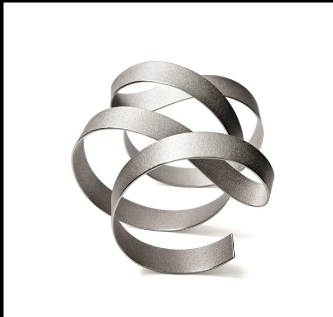
Waves #5 wide, 2012 unique arm piece, initialled & hallmarked 100% recycled sterling silver 11.5 x 10.5 x 9 cm Individually sculpted, unique within a series