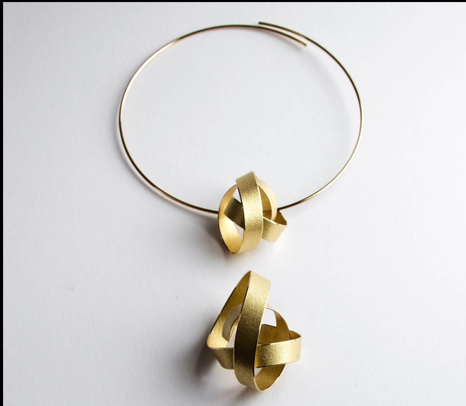
Whirling Wave , 2022 sculptural pendant, initialled & hallmarked 18 kt Fairtrade Gold Large approx. 5.5 x 4 x 4.5 cm ; medium approx. 4 x 3.5 x 3.2 Individually sculpted, unique within a series of 30