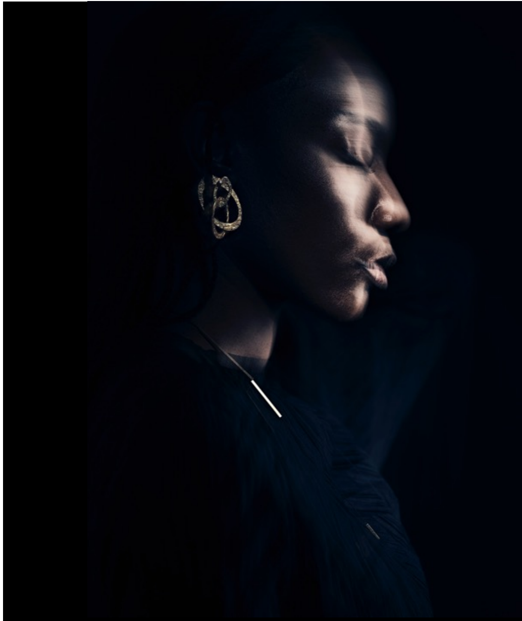
Improvisations on Ovals, 2022 sculptural earrings, initialled & hallmarked 18kt Fairtrade Gold 4 x 10 x 3 cm one earring - 4.3 grs unique within a series of 24