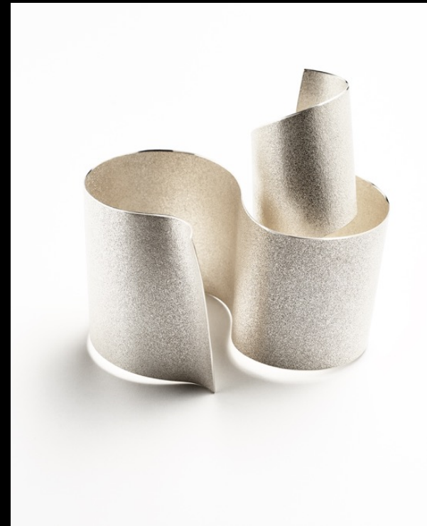
Wild Waters , 2022 - arm sculpture, initialled & hallmarked, 100% recycled sterling silver, 10.5 x 9 x 6cm, individually sculpted, unique within a series of 12