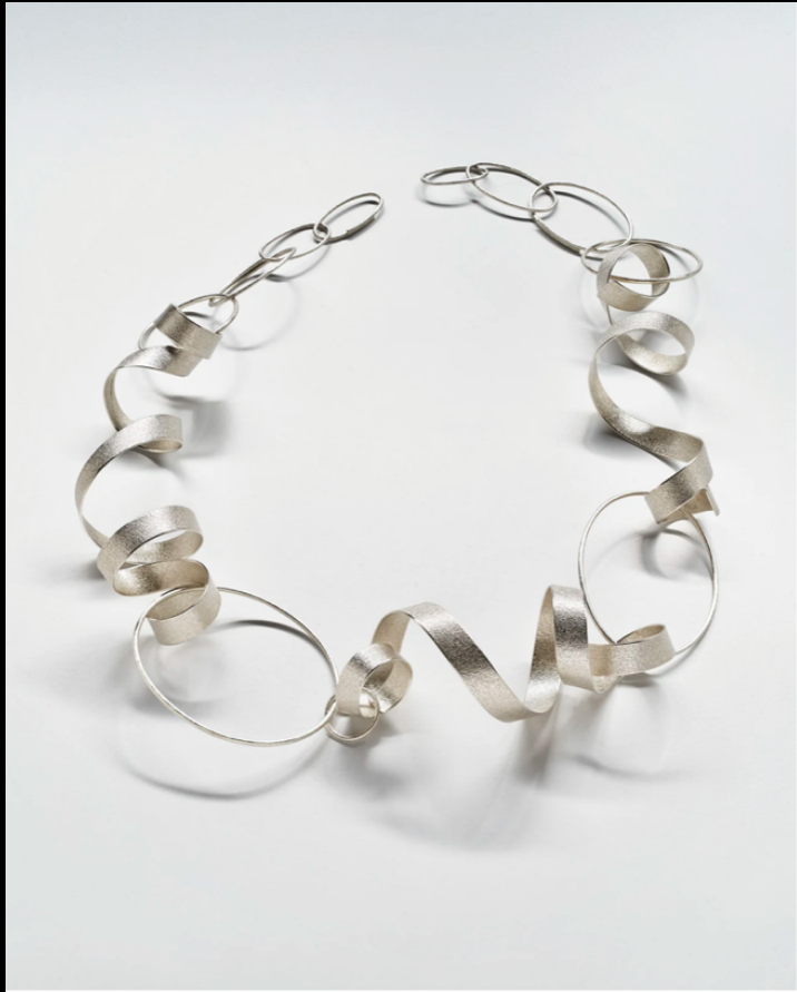
Islands Surrounded by Waves, 2017-2022 neck piece, initialled & hallmarked 100% recycled sterling silver on bust 36 cm full length 78 cm individually sculpted, each piece is unique within a series of 24