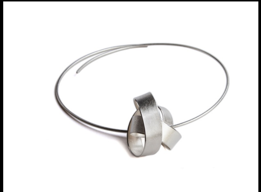
Whirling Wave , 2022 pendant, torque, initialled & hallmarked 100% recycled sterling silver individually sculpted, each piece unique within a series