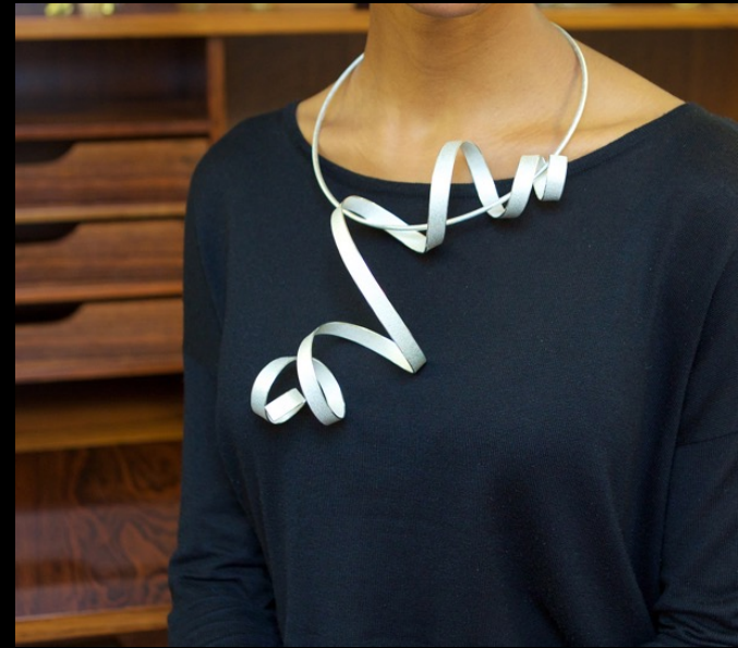
Calligraphy 2, 2019 - sculptural pendant, initialled & hallmarked, 100% recycled sterling silver, 22 x 9.5 x 5.5 cm, individually sculpted, unique within a series