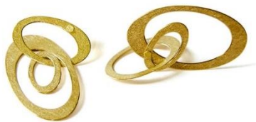
Improvisation Loops, neck sculpture, recycled silver, 18kt Fairtrade Gold

“Ethics in jewellery is not just about the environment, it is equally about the untold stories of social, political and economic exploitation. While I have more questions than answers, with these miniature sculptures and the materials I use, I want to explore alternative visions of dignity and empowerment”.