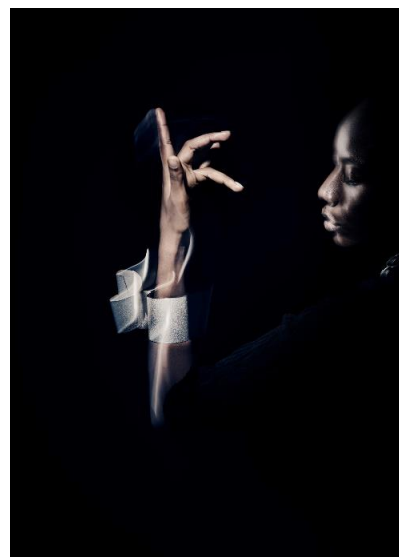
Wild Waters, arm sculpture, recycled silver